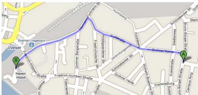
From the main gate to the Haven Höövt shopping mall